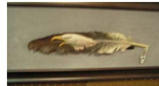
Kathy Flanagan's Best of Category

39th Annual International Federation of Leather Guilds Show: Colorado Roundup . Sept. 30—Oct. 1, 2, 2005. Doubletree Hotel, (303-321-3333) 3203 Quebec St. Denver, CO 80207. Rates are $79.00 per night + tax. Banquet will be at $30.00 per/choice of 3 entrees. Reg. fee $3.00 each. Entry fees: $3.00 per item.